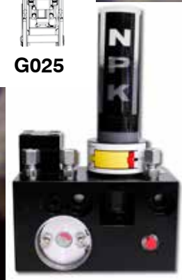
Output from 0.8 to 1.44 lb/hr