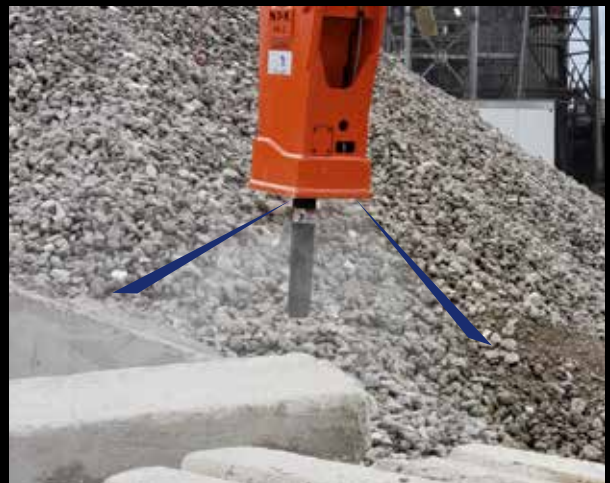
Wide spray angle for maximum coverage